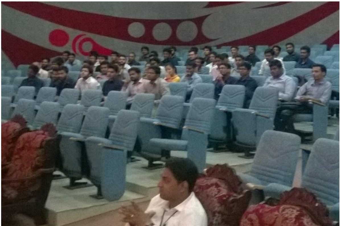
Participation of students in guest lecture