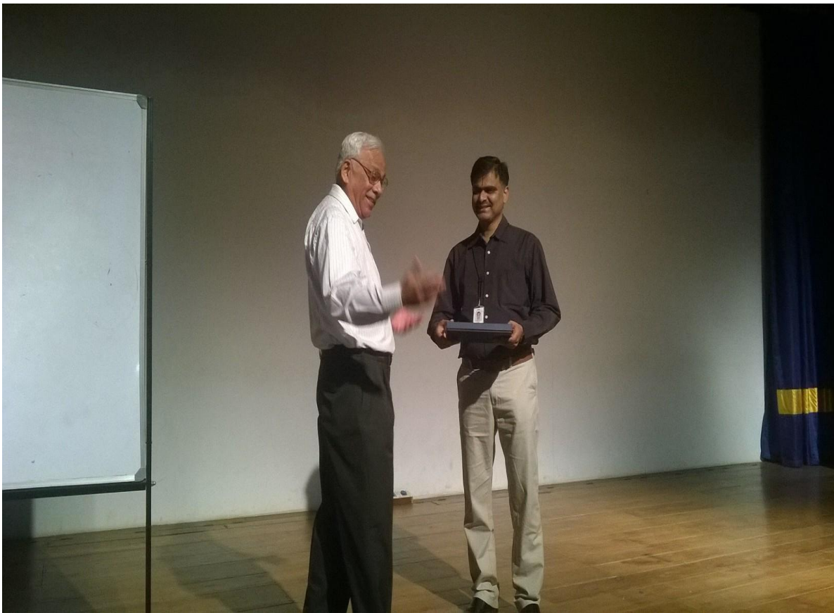
Honoring the guest with a Memento