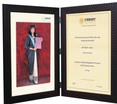
Hinged & Folding Photo Frame One 8"x12" Print with frame