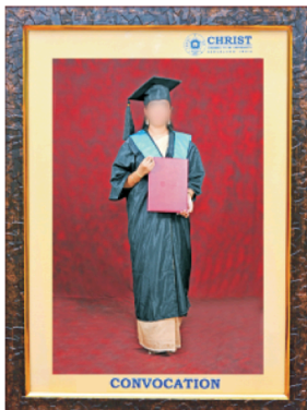
Classic Mount 8"x12" Print with Glass frame

The university is not responsible for any matters related to this facility used by students.