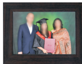
6x8 Print with Frame