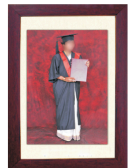
8x12 Print with Frame