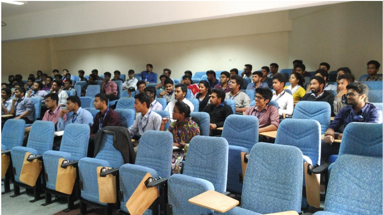
Student participation in the Guest lecture