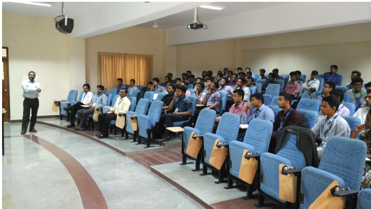
Interaction of the guest with the students