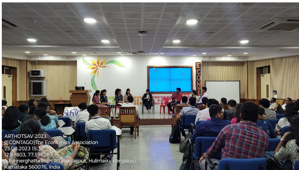
A snapshot from the Sustanify Event, taken on 25 th August, 2023 at 15:38 PM at CHRIST (Deemed to be University), Bannerghatta Road Campus (12.877° N, 77.595° E).