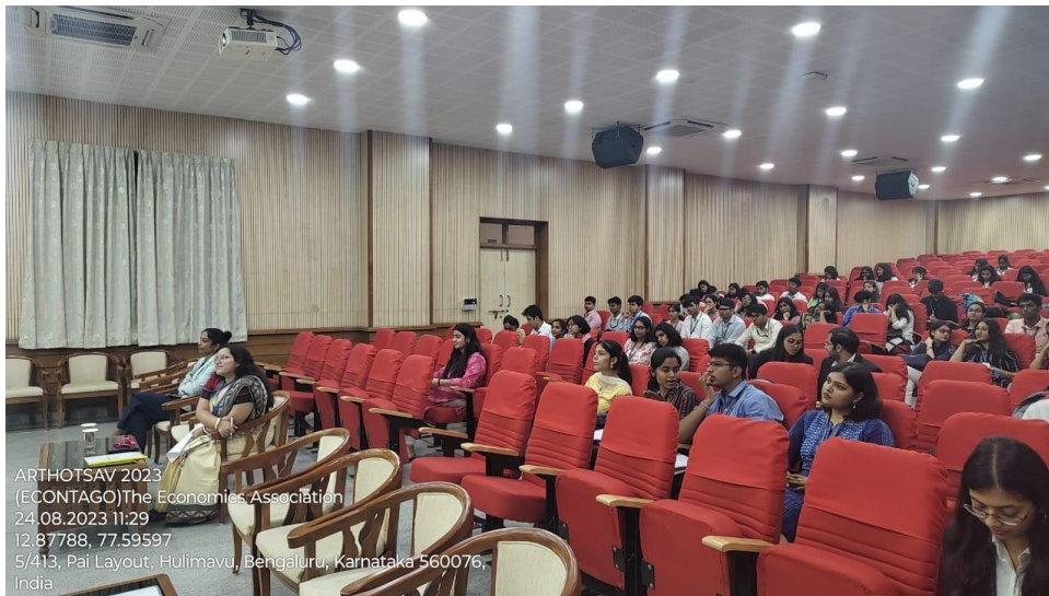
A snapshot from the Sustanify Event, taken on 24th August, 2023 at 11:29 AM at CHRIST (Deemed to be University), Bannerghatta Road Campus (12.877° N, 77.595° E).