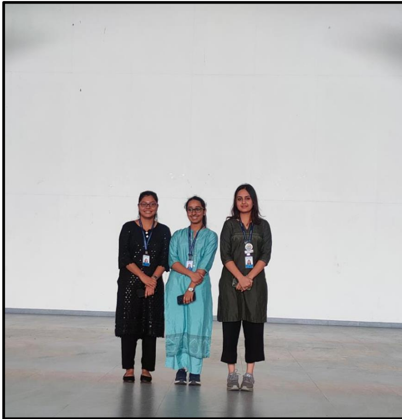
The Winners of the event